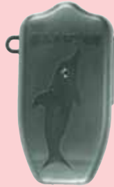
Optional protecting box